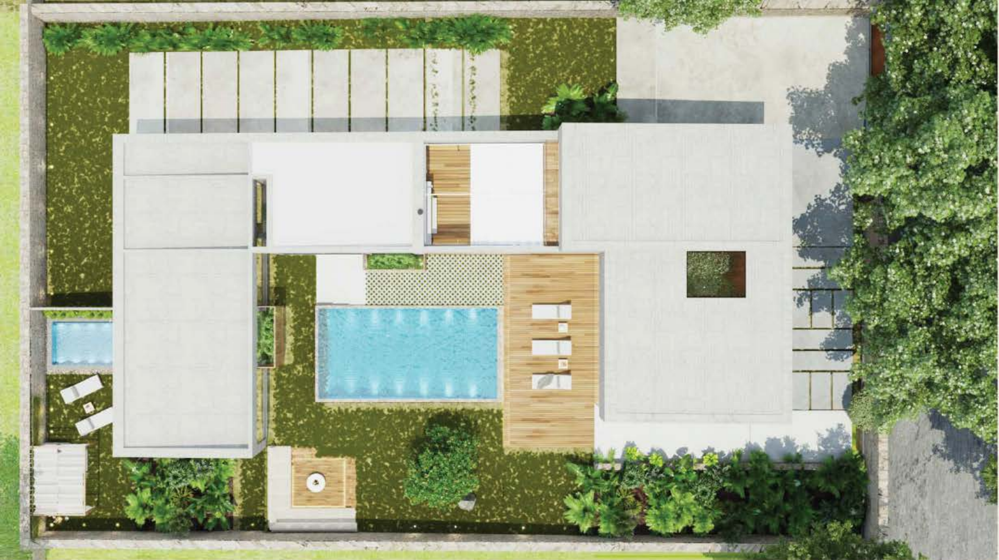
Unique U Shaped Houses